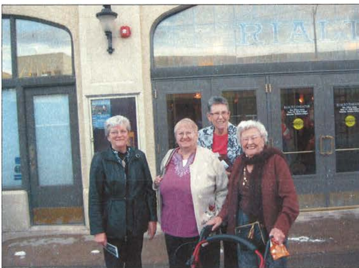
Above: Attending "Kitchen Witches" at the Rialto Theater

Our Pajama Party on January 13th was a rousing success. Since decency laws probably prohibit publishing photos of pajama-clad residents, you will just have to take our word for it! We can show you the pig slippers, however.