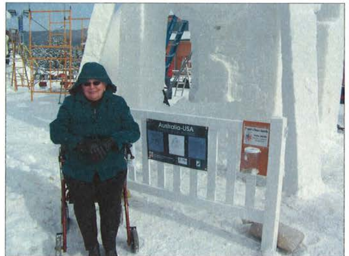
Breckenridge Ice Sculpture Festival –January 27th