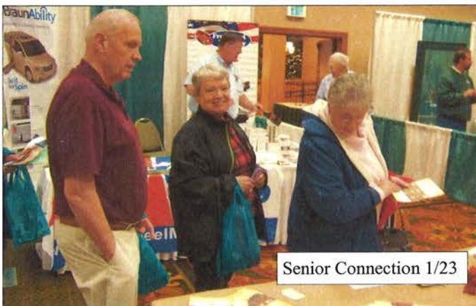
Senior Connection 1/23