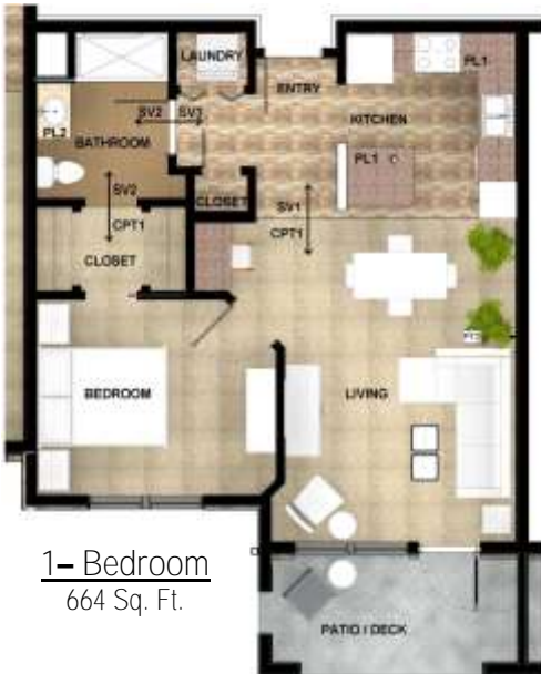
1- Bedroom 664 Sq. Ft.